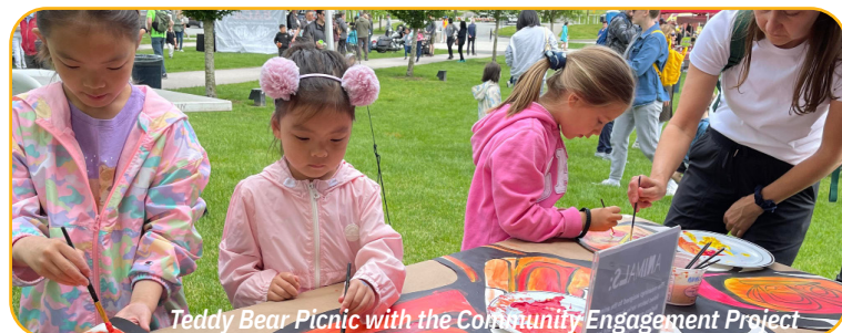
Teddy Bear Picnic with the Community Engagement Project