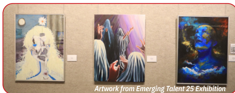
Artwork from Emerging Talent 25 Exhibition

We also offered 4 workshops for the Canucks Autism Network Foundation (CAN) summer camps with three skilled teachers offering classes in music, visual arts and dance. Students between the ages of 7 and 12 participated and were accompanied by CAN support workers.