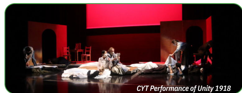
CYT Performance of Unity 1918

To improve our programs, we acquired a custom-made modular theatre unit set for our Coquitlam Youth Theatre productions. The unit set elevates our students' performance experience, provides a cost-saving, environmentally friendly production solution and allows us to take our theatre shows on tour to local schools and community venues with greater ease.