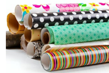
Other colourful, recycled paper like wrapping paper or old newspapers