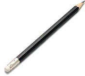
A pencil and eraser