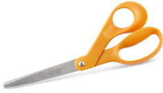
Scissors for cutting paper

Step 1: Start by gathering the following materials: