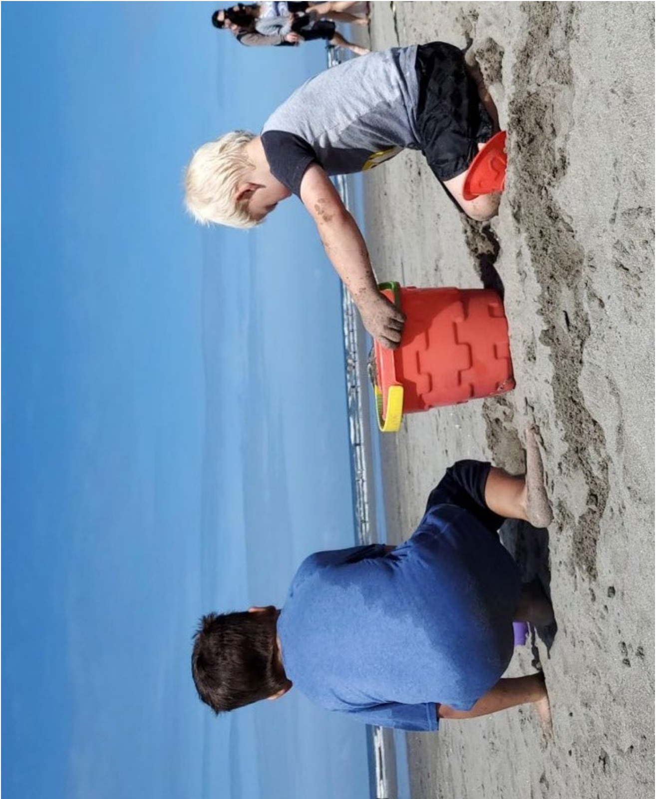
Free photo reference for artists on Facebook