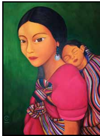
The Nap , acrylic by Clarissa Argueta